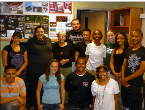
CSU Ram.Co Mentors for Fall Semester 2012