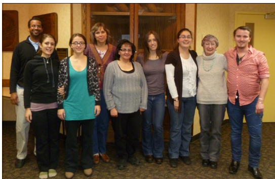
Fort Collins, Colorado Facilitators Workshop