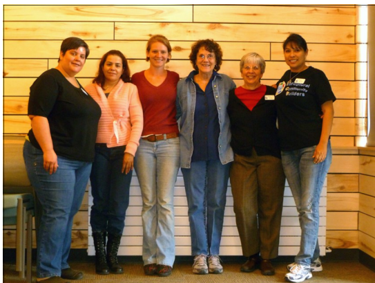
Basalt, Colorado Facilitators Workshop