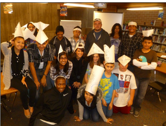
Ram.Co CSU Mentors and Lincoln students posing in the career hats they made.